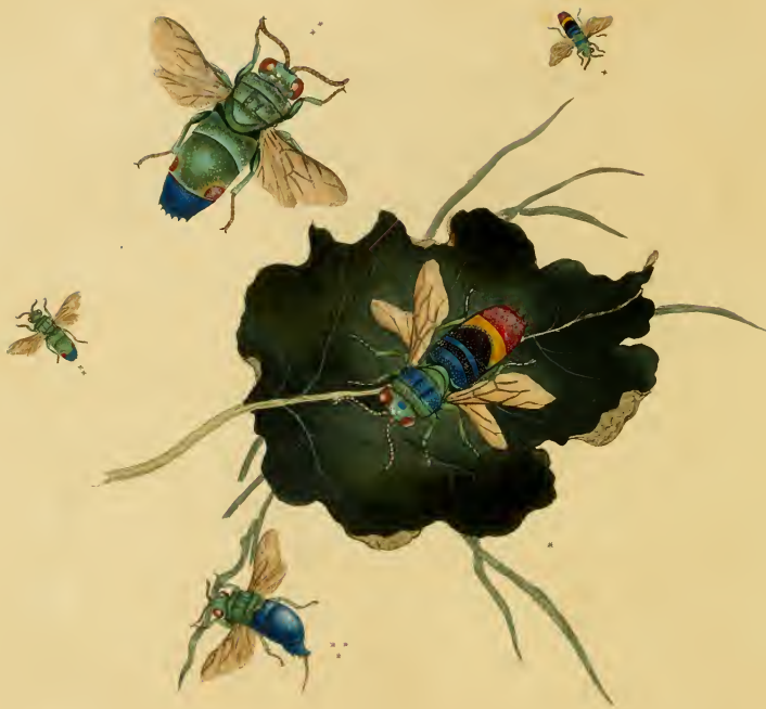
Chrysis fasciata. Chrysis oculata. Chrysis splendida.