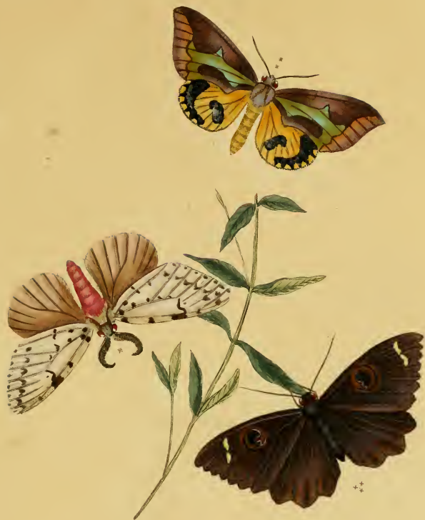
Phalana figura. Phalana strigata. Phalana hieroglyphica.