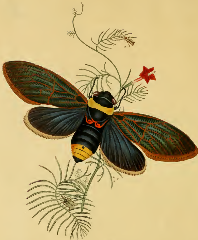
* Fulgora lineata. * Fulgora pallida. ** Cicada indica.