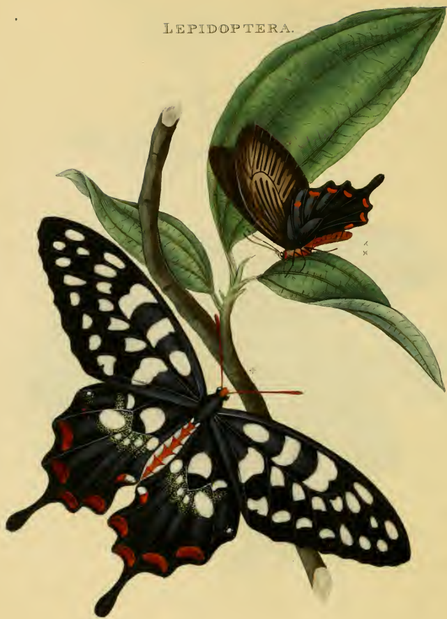
* Papilio Antenor. Papilio Antiphæus. *