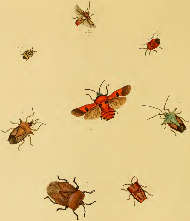
Cimex virripes. papiliofus, cruciatus. maculans, uniguttatus. viridis, ferratus.