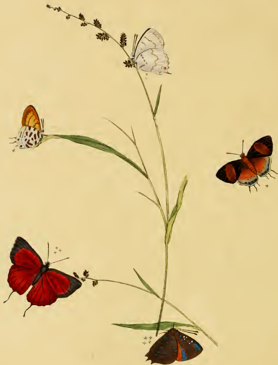
* Papilio Lisius. * Papilio Sophocles. * * * Jarbas. * Thales. * *