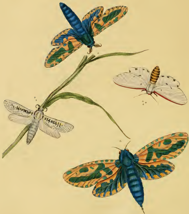
Phalena Minus. Phalena scalaris.: Phalena junonensis.: