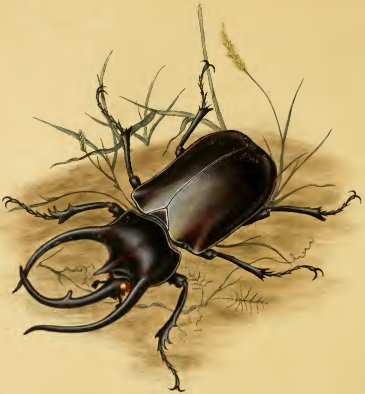
Lucanus - Illus.