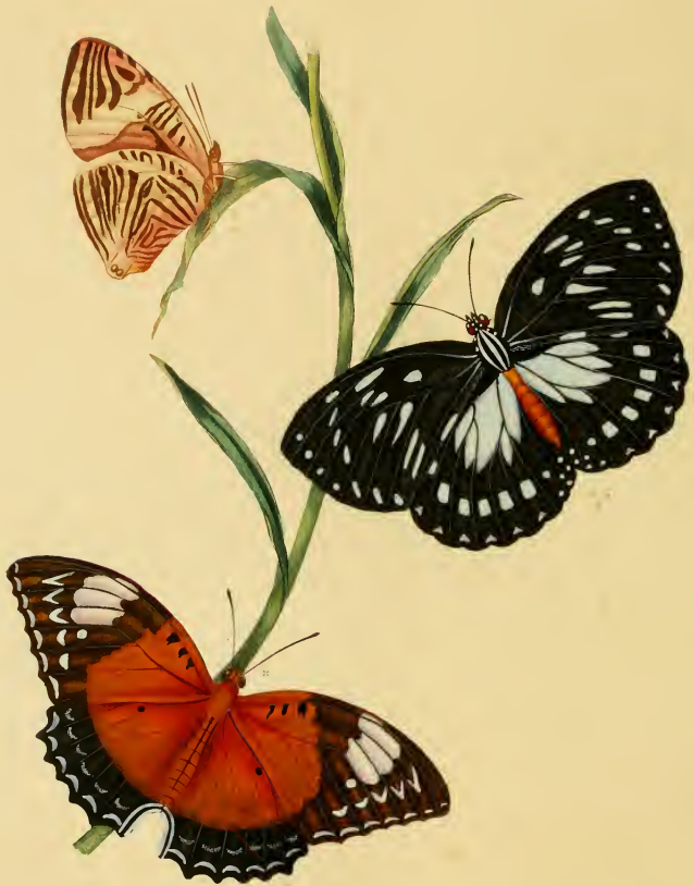
Papilio Cyathippe. Papilio Dione. Papilio Euronimene.