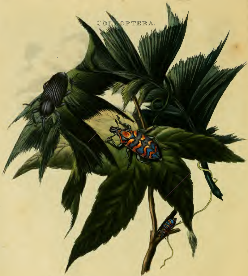
Curculio Regalis. Curculio Palmorum.