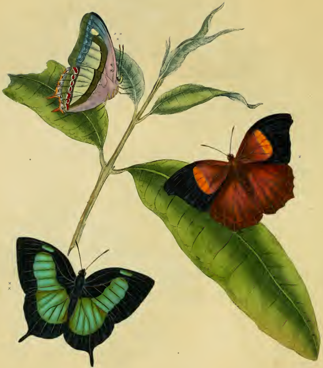
* Papilio Cincta. Papilio stans. * * * Papilio Pyrreus.