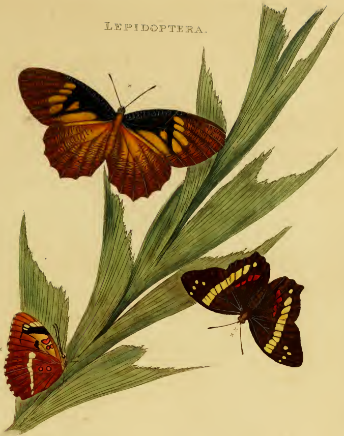
Papilio Phegea . * ** Tratoma Thyelia . * *