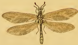
Myrmelcon Pardalis. * Myrmelcon punctatum.