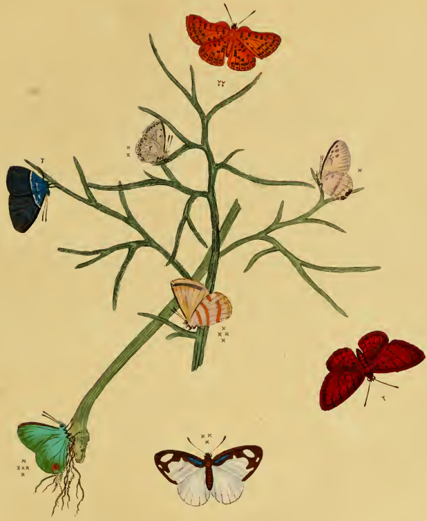
* Papilio Bibulus. * Nylax. Coenus. * * Livius. Romulus. * * Ptolemæus. Uridius. **