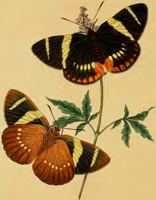
Papilio Evallthe .