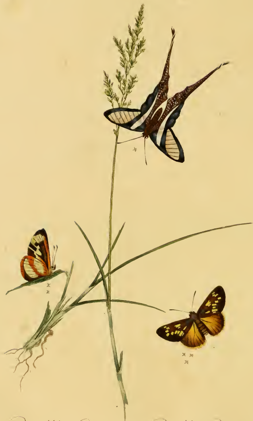
* Papilio Curius. Papilio Propeituis. * * * Papilio Tibullus.