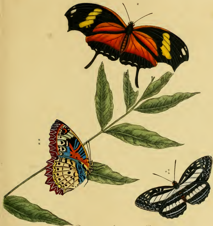
* Papilio Hippona. Papilio Cyane. * * * Papilio Coenobita.