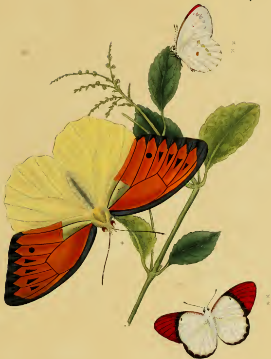
* Papilio Leucippe. Papilio Danae. *