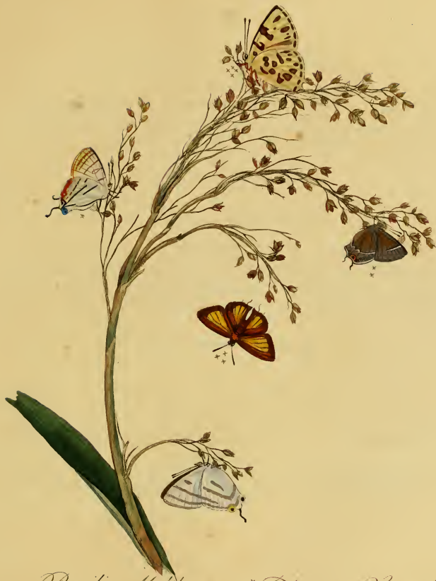
* Papilio Melibor. * * Tyrtius Xenophon. * * * * Achirus Phorbus. * * *