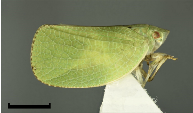
Fig. 1. Acanalonia conica (Say, 1830) lateral view (female, HNHM; scale bar: 3 mm)

Measurements of body length. male (HNHM): 8.76 mm; females (HNHM): 9.77–10.1 mm.