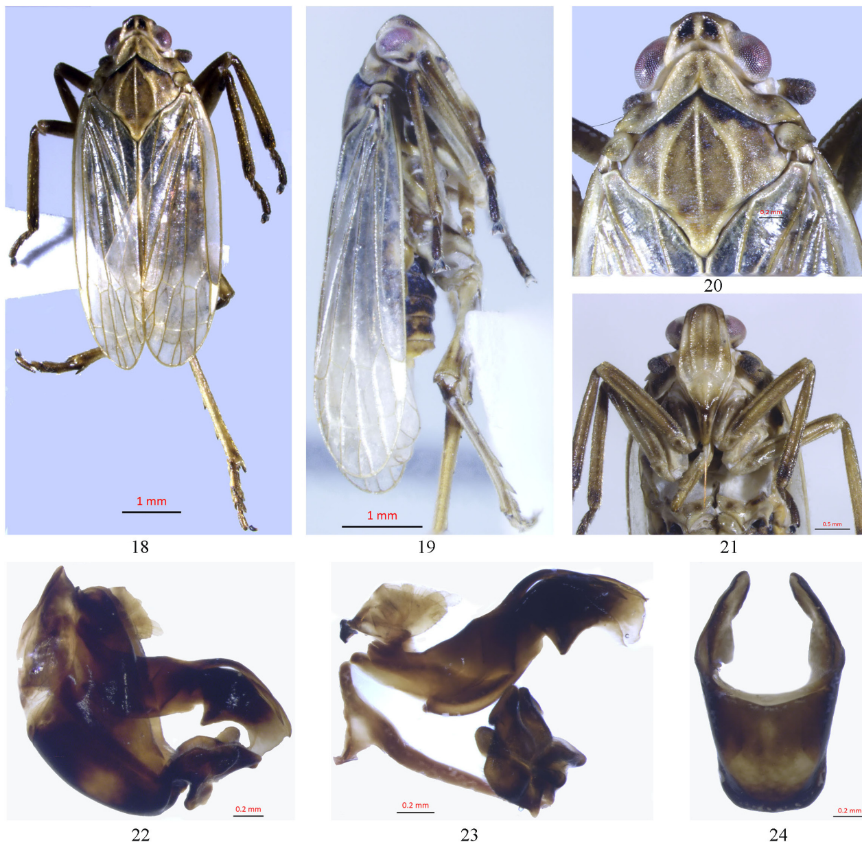
FIGURES 18–24. Zema gressitti . 18, 19. Adult, dorsal and lateral view; 20. Vertex, pronotum and mesonotum, dorsal view; 21. Frons, ventral view; 22. Genitalia, lateral view; 23. Anal segment, aedeagus and genital style, lateral view; 24. Pygofer, lateral view.

Remarks: This species can be distinguished from the other species of the genus, Z. montana Wang & Liang, 2007, from China, by the shorter median carina of vertex (in basal 2/3 rather than throughout length of vertex), asymmetrical periandrium and aedeagal process bifurcate at mid length of aedeagus (rather than distally).