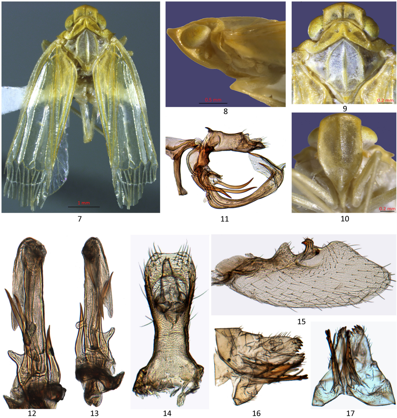
FIGURES 7–17. Epora montana (from Pakistan) 7, 8. Adult, dorsal and lateral view; 9. Pronotum and mesonotum, dorsal view; 10. Frons, ventral view; 11. Anal segment and aedeagus, lateral view; 12. Aedeagus, dorsal view; 13. The same, ventral view; 14. Anal segment, dorsal view; 15. Genital style, lateral view; 16. Female genitalia, lateral view; 17. The same, dorsal view.