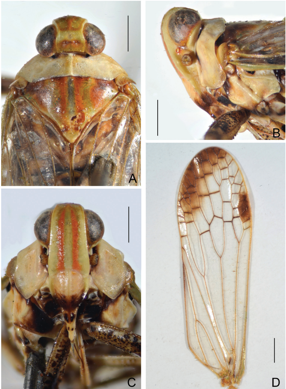
Figure 2. Chiltana acarinata sp. n. A Head, pronotum and mesonotum, dorsal view B head and pronotum, lateral view C head and pronotum, ventral view D forewing. Scale bars: 1 mm.

Etymology. The specific epithet is borrowed from New Latin acarinatus , referring to the carinae on the frons and mesonotum being absent.