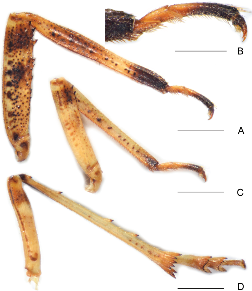
Figure 3. Chiltana acarinata sp. n. A Fore leg B fore tarsomeres and pretarsus C middle leg D hind leg. Scale bars: 1 mm.

Remarks. The new species may be distinguished from the type species of Chiltana , C. baluchi , by the different male genitalia.