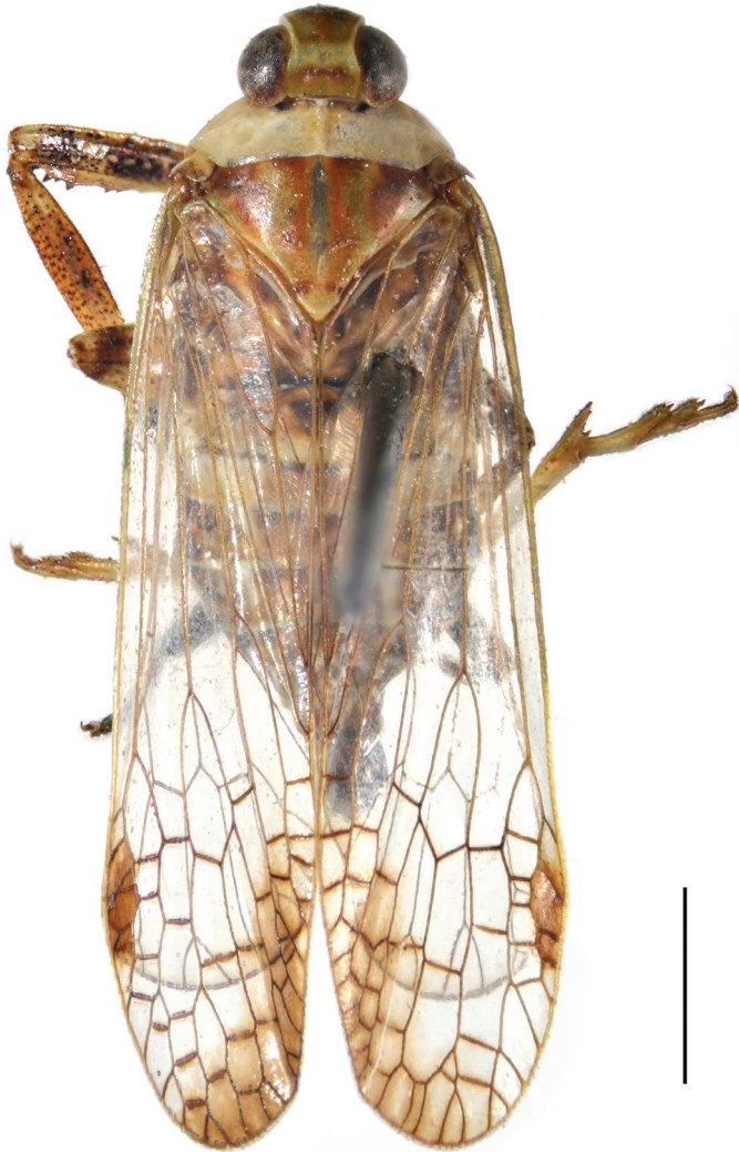
Figure 1. Habitus of Chiltana acarinata sp. n. Scale bar: 2 mm.

cesses elongate and robust, extended from phallobase, curved dorsad and then ventrad, apex sclerotized, elongate and acute (Fig. 5B). Phallobase with three pairs of inflated membranous lobes: a pair of large and stout dorsal lobes, directed dorsad, with a large and stout spine on apex of each lobe (Fig. 5A, B, D); a pair of large, strongly inflated, rounded ventral lobes, directed laterad, covered with numerous minute superficial spines (Fig. 5B–D); and a pair of elongate thumb-like ventral lobes extended from dorsal side of rounded ventral lobes, their apices gradually convergent and tapering dorsad, muricate apically (Fig. 5B–D). Segment X, in dorsal view (Fig. 5A), oval and broadest medially, with ratio of length to maximum width 1.1:1; in lateral view (Fig. 5B), short and robust, with ventral margin gradually widening from base to apex; anal style large, beyond apical ventral margin of segment X.