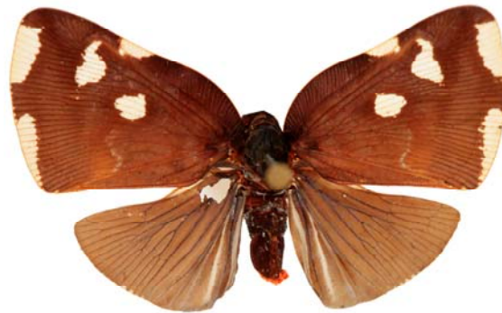
Fig. 1 – Ricania speculum (Ricaniidae). Upperside. Philippines, Negros Island, Kanlaon Mt.