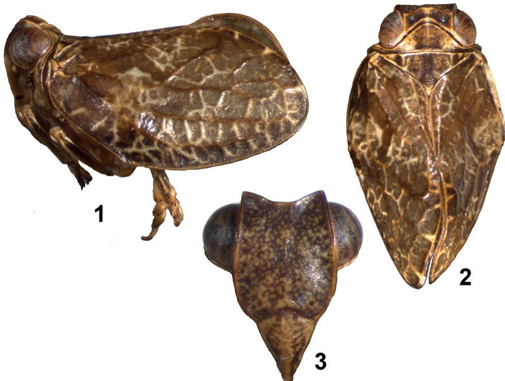
Figs 1–3. Sarnus rhomboidalis Fennah (Madagascar). 1, body, lateral view; 2, body, dorsal view; 3, head, frontal view.

Supplementary description (based on Madagascan specimen). Metope elongate, slightly convex, with weakly convex lateral margins and without median and sublateral carinae (Fig. 3). Upper margin of metope angularly concave. Metopoclypeal suture groove-shaped. Postclypeus without carina. No ocelli. Coryphe short, transverse (at least 0.2 times as long medially as wide), without carina, its anterior margin distinctly convex, posterior margin strongly concave (in dorsal view) (Fig. 2). Pedicel short, rounded. Pronotum without carina, anterior margin strongly convex, posterior margin straight. Paradiscal fields of pronotum very narrow behind eyes. Paranotal lobes of pronotum