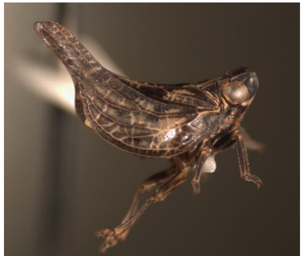
Fig. 1. Paralusanda sinuatipennis Synave, female, lateral view. Total length – 5.0–5.1 mm.

Male genitalia (Figs 4–7). Pygofer wide, with nearly straight hind margin (in lateral view) (Fig. 6). Anal tube elongate, twice as long as wide at midline, nearly oval (in dorsal view) (Fig. 5). Lower margins of anal tube straight (in lateral view). Paraproct wide and long, 0.3 times as long as anal tube. Phallobase enlarged apically (in lateral view), with pair of large