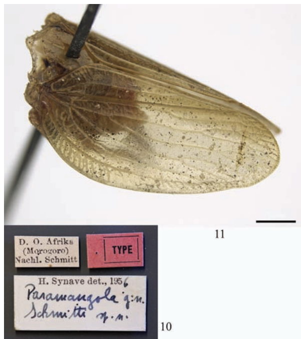
Figs 10–11. Paramangola schmitti Synave, holotype. 10 – labels, 11 – fore wing. Scale bar – 2 mm.

Supplementary description (Figs 11–13). Fore wing wide, narrowing apically, with many transverse veins in subcostal area (Figs 11, 12). Basal cell large, elongately oval. R and M start from basal cell in one point. R 4 (first furcation at basal cell; posterior branch furcating apically) M 8 (first furcation in proximal half of the wing before its middle; other furcations in distal half of the wing apically) CuA 3 (first furcation in