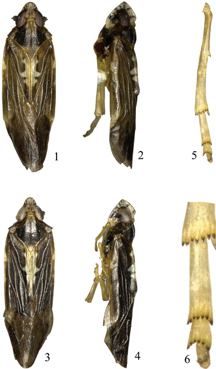
Figures 1–6. Eudeferunda alatea Long & Chen sp. n. 1 Male habitus, dorsal view 2 Male habitus, lateral view 3 Female habitus, dorsal view 4 Female habitus, lateral view 5 Hind tibia and tarsus 6 Apex of hind leg.

Etymology. The species name is derived from the Latin word “ alate ”, indicating the phallobase with a pointedly alate process at base 1/3 of each lateral side.