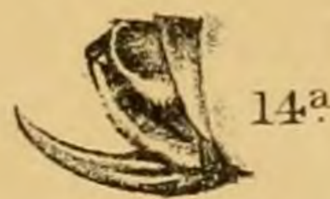
14 a .